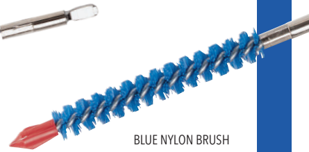
BLUE NYLON BRUSH