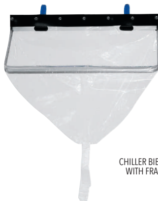
CHILLER BIB BAG WITH FRAME