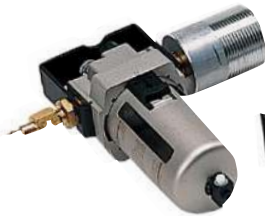
703Q REPAIR KIT