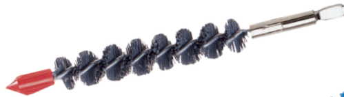
SPIN GRIT BRUSH